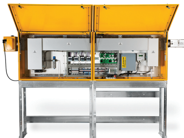
A DOAS monitoring system.