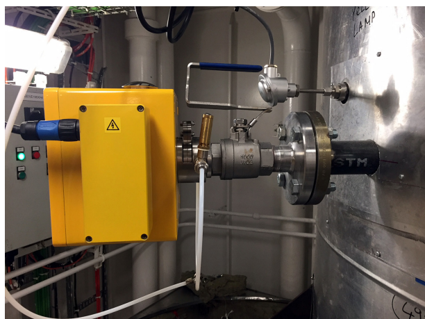
An OPSIS ship installation

One analyser can be connected to several measurement paths using an optical multiplexer, making a cost-effective solution for up to 10 monitoring points.